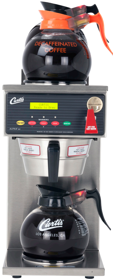
ALP3GT63A800 Alpha™ FreshTrac™ 3 Station Brewer with three 64 oz. FreshTrac™ Decanters