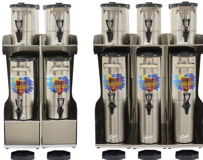
TCNRS21A000 SIDE BY SIDE Shown with Two TCN1510 (Upper Shelf) and Two TCN14 (Lower Shelf)

Dispensers with Drip Trays are Sold Separately