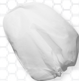
WC-9910 Toddy strainer

1 Toddy reusable coffee strainer 50 Toddy one-time use paper filters