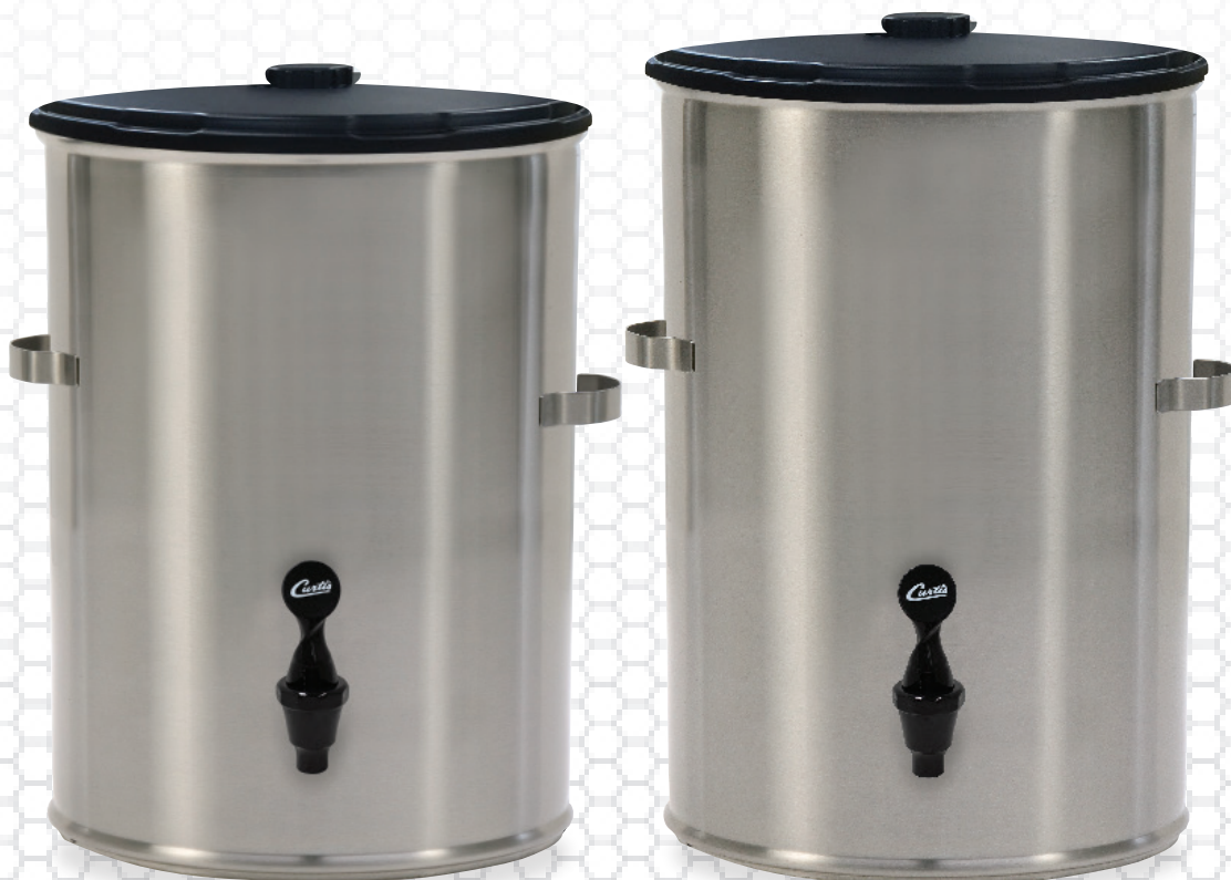
TC-6HK 6.0 Gallon Cold Brew Coffee System