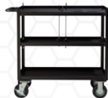
OMSCP Cart with pneumatic wheels