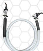
WC-1019 Jug filler