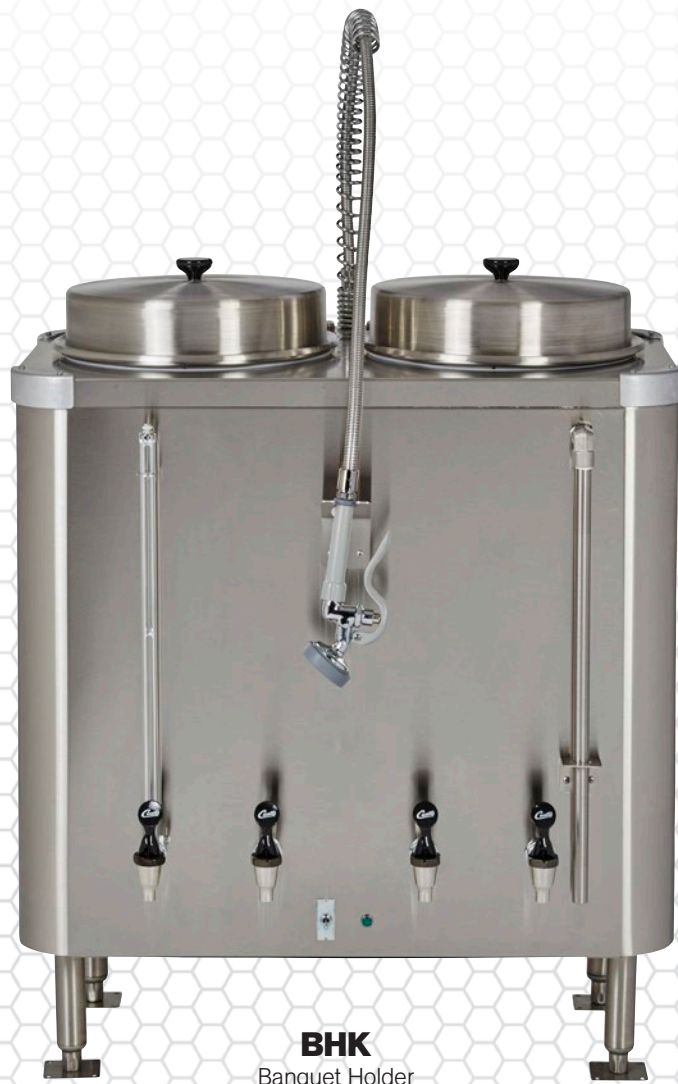
BHK Banquet Holder