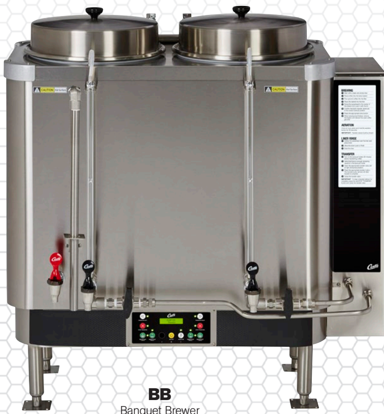
BB Banquet Brewer