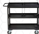
OMSCR Cart with rubber wheels