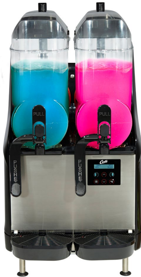
CFBX2 Twin Frozen Beverage Machine With Two 3.0 Gallon Bowls