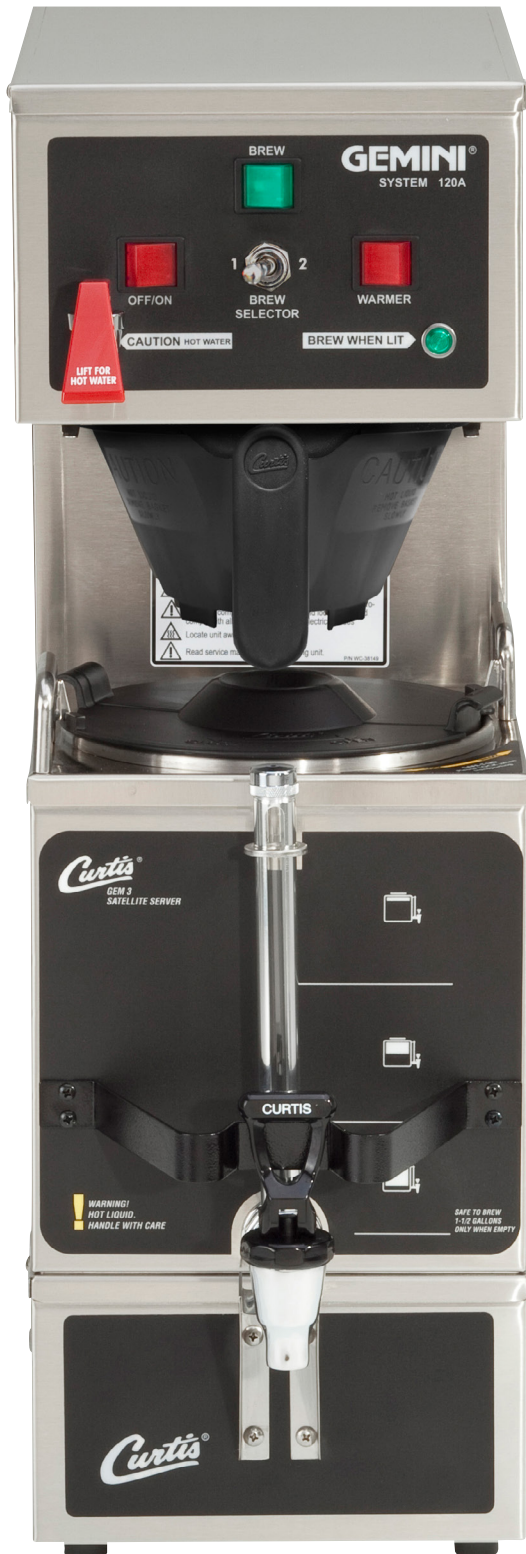
GEM-120A-10 with Standard Brew Basket

Model: GEM-120A-10 (120V with Standard Brew Basket) GEM-120A-12 (120V with High Capacity Deluxe Brew Basket) GEM-120A-30 (220V with Standard Brew Basket)