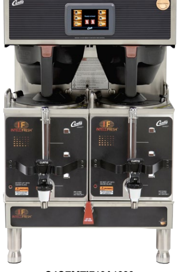
G4GEMTIF10A1000 Twin 1.5 Gallon IntelliFresh® Coffee Brewer (Stainless Steel)