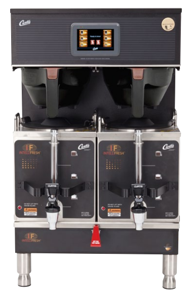
G4GEMTIF10B1000 Twin 1.5 Gallon IntelliFresh® Coffee Brewer (Black Powder Coated)