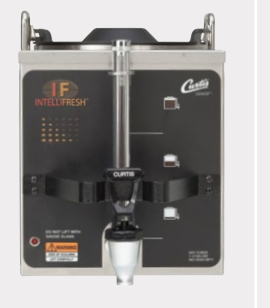
GEM3IF (1.5 Gallon IntelliFresh® Satellite)