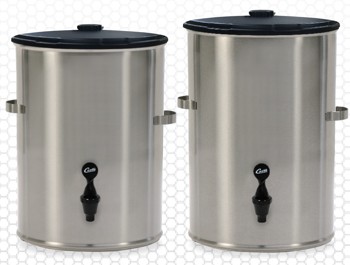
TC-6H 6.0 Gallon Cold Brew Coffee System