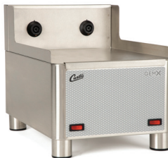
GEM5XN IntelliFresh® Warmer Stand (Sold Separately)