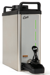
GEM3XN 1.5 Gal. Dispenser with IntelliFresh & FreshTrac (Two Included)